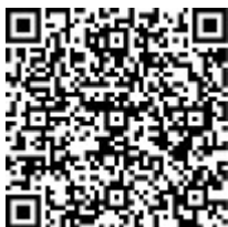
DR.VINAY CHOPRA CONSULTANT PATHOLOGIST MBBS, MD (PATHOLOGY & MICROBIOLOGY)

LOW RISK: 3.30 - 4.40 AVERAGE RISK: 4.50 - 7.0 MODERATE RISK: 7.10 - 11.0 HIGH RISK: > 11.0