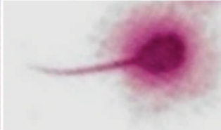
2. Medium halo